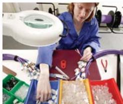
Quality controlled factory pre-terminated links.