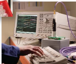
Links pre-tested to relevant cabling standards.